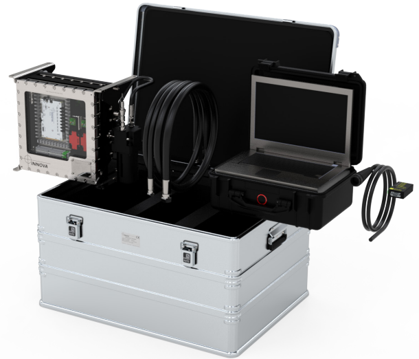
Valve pack with transportation box and accessories