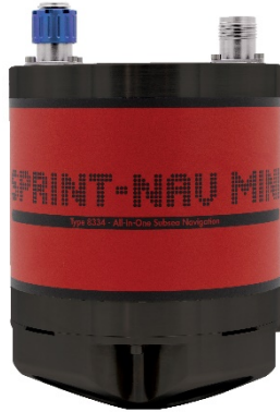
SPRINT-Nav Mini 300 m