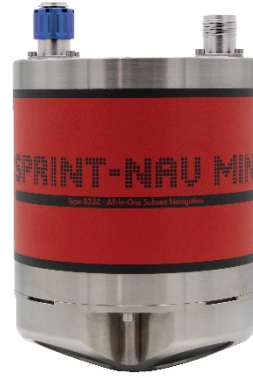
SPRINT-Nav Mini 4,000 m