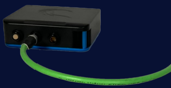
Up to 100m cable length