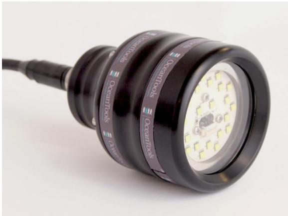
24VDC L5 Flood (4000m Aluminium)

24VDC or 120VAC flood and spot lamps with up to 12,000 lumen output, supporting a range of control options.