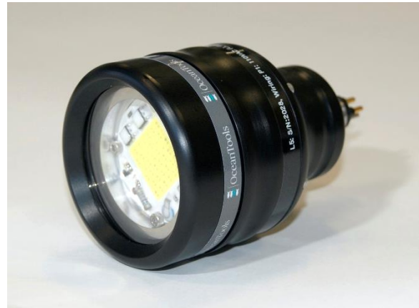
120VAC L5-AC Flood (4000m Aluminium)

The OceanTools L5 subsea lamp utilises the very latest in LED technology and optics to give unrivalled performance and generate a market leading efficiency of more than 220 lumens per Watt, resulting in an output of up to 12,000 lumens.